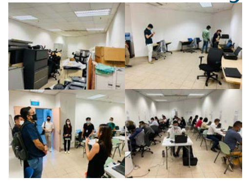
MOTF CC was manned in shifts by 70 pilots, cabin crew, medical students and MOH staff

A comprehensive medical strategy was established to ensure that individuals infected with COVID-19 receive prompt and quality medical treatment. A tactical plan has been put in place to transfer patients into appropriate tiered facilities for medical care and support; ramp up healthcare capacity through collaborations between the public-private hospitals, and augment the healthcare manpower through the formation of SG Healthcare Corps. An Inter-Agency Task Force has been set up to systematically and progressively clear dormitories through aggressive testing of foreign workers residing in them to ensure that the workers are well and can safely resume work.