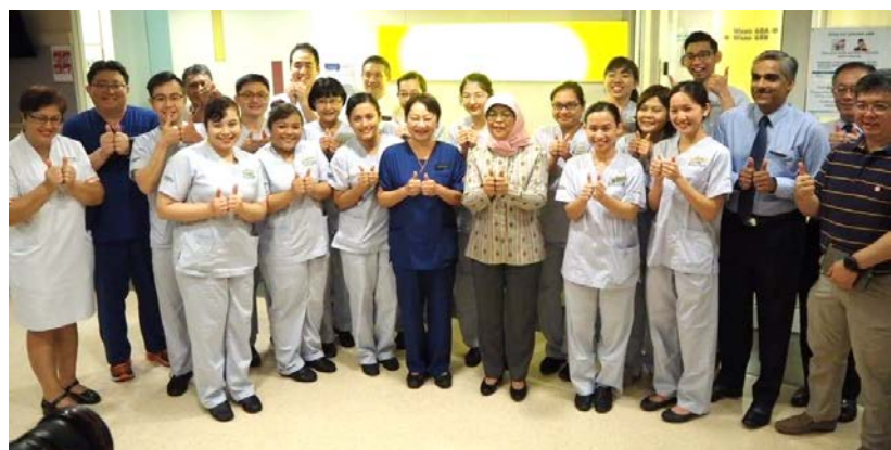
(Note: Photo was taken before safe distancing measures and the use of masks were mandated)

? DID YOU KNOW ACE will be turning 5 in August 2020