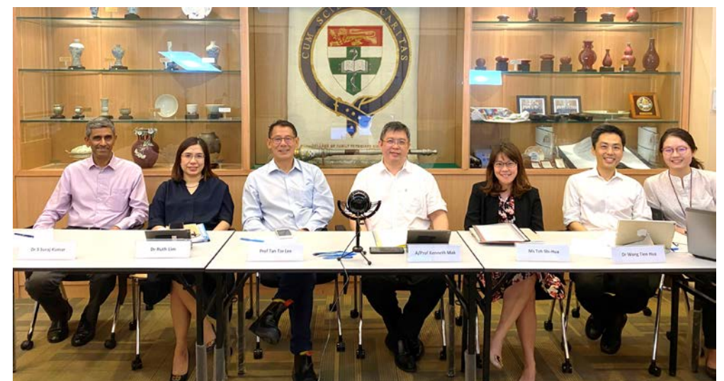
Webinar with CFPS (Note: Photo was taken before safe distancing measures and the use of masks were mandated)